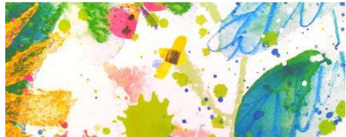
IL NOSTRO GIARDINO STRAORDINARIO