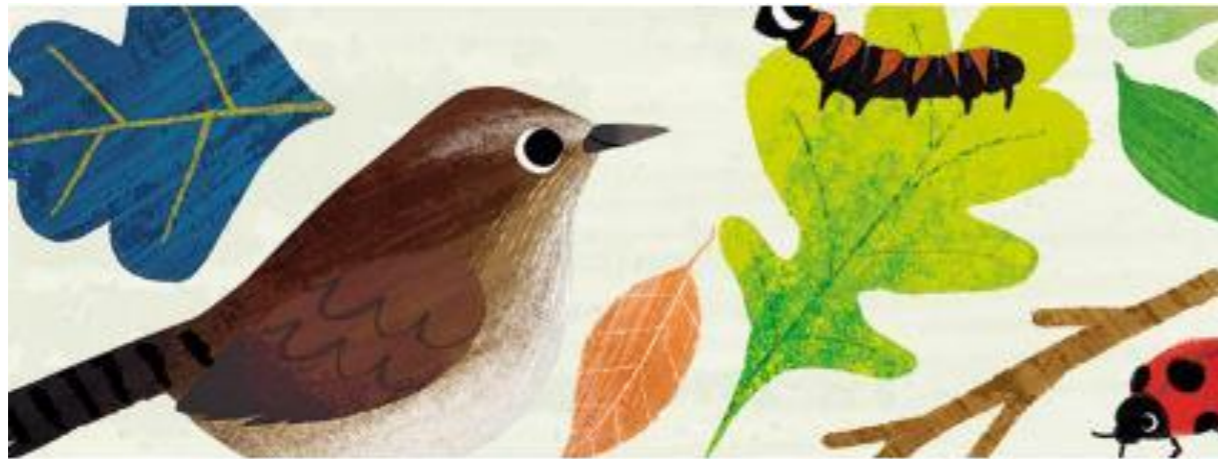
GLI ESPLORATORI DELLA SEZIONE ARIA 🔍